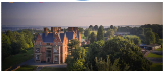
BOREATON PARK 2024, Shropshire

The children dived into a whirlwind of new activities—abseiling down tall towers, canoeing across serene waters, building their own buggies, tackling survivor challenges in the woods, engaging in thrilling laser tag battles, climbing the dizzy heights of Jacob's Ladder, and testing their skills in archery tag. We trekked miles around the sprawling PGL site, indulged in lots of delicious food, sang our hearts out, all on very little sleep!